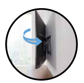
Swivels up to 15° both right and left for wider viewing area & ease of access